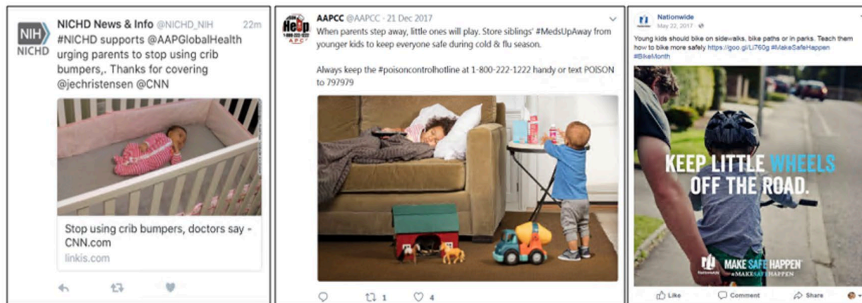
Figure 1. Social media posts viewed by parents. Left: Safe sleep (mismatching), Middle: Poison prevention (mismatching), Right: Bike safety (matching)

recommends parents store "all medicines up and away." The bike safety post features an image of a young child, wearing a helmet while riding a bike on a sidewalk with the help of a parent. This image is matched to the recommendation in the text which states that "young children should bike on sidewalks, bike paths or in parks."